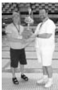
Region E – Provincial Winners